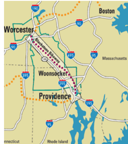
Overview of Blackstone River Bikeway

Responsible Parties: BRVNH, Land Trusts, State Agencies