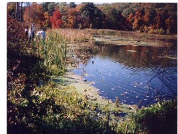
Rice City Pond, Uxbridge,

Responsible Parties: Land Trusts, MA-DCR, RI-DEM, Municipalities