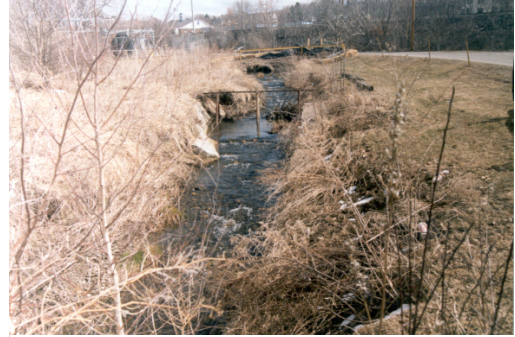
Weasel Brook, Worcester

Originating as a series of streams in the hills of Worcester, the Blackstone River flows 48 miles south into Rhode Island, dropping 450 feet before emptying into Narragansett Bay near Providence. The Blackstone River Watershed comprises a total of 640 square miles, with 382 square miles located in south central Massachusetts and 258 square miles in northern Rhode Island. The length of the mainstem Blackstone River is evenly divided between Massachusetts and Rhode Island, with 24 river miles in each state. The major tributaries of the Blackstone River are the Quinsigamond, West, Mumford, Mill, and Peters Rivers. 1,300 acres of lakes, ponds, and reservoirs are also located within the watershed.