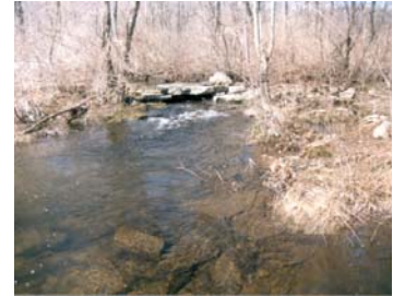
Broad Meadow Brook Wildlife Sanctuary

C. Wildlife Habitat / Ecological Resources: This map consists of wildlife habitat and ecological resources features readily available from MassGIS, including: