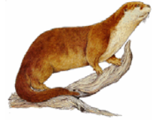
River Otter Lutra canadensis

At the project kickoff meeting on January 23, 2004, the WAC discussed the process of developing a Watershed Action Plan and debated the establishment of action planning priorities. The Committee reached consensus on working within the framework of the eight planning categories listed below. At the planning session held on August 12, 2004, the WAC voted to select the top three planning category priorities for the watershed. As indicated below, the WAC voted that the planning category of “Water Quality Improvement and Protection” was the highest priority for the watershed.