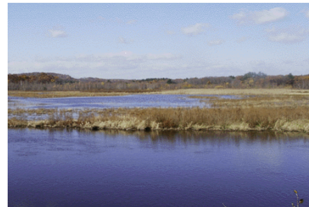
Fisherville Marsh, Grafton

Responsible Parties: Municipalities, MA-DEP, RI-DEM