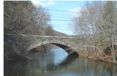
Stone arch bridge over the Blackstone River.

A variety of previous studies, planning documents and other information sources related to the Blackstone River Watershed were reviewed by GeoSyntec in developing this Watershed Action Plan. These information sources are listed in a table on page 12. A brief overview of the Blackstone River Watershed and related planning issues is provided below, as excerpted from several of these information sources.