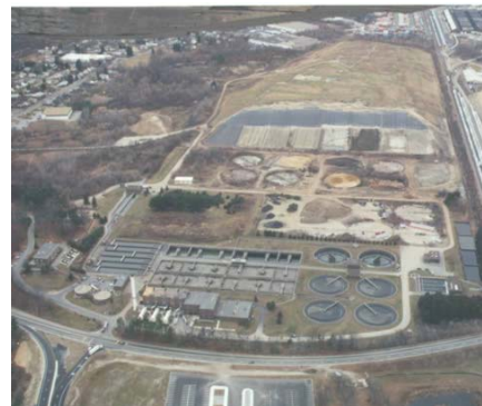
The Upper Blackstone Water Pollution Abatement District (UBWPAD) treatment plant