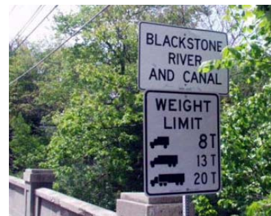
River signage at bridge crossing Uxbridge, MA

Responsible Parties: non-profits, MA-Riverways Programs