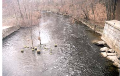
Blackstone River at Route 16 in Uxbridge

Responsible Parties: MA-EOEA, RI-DEM, NON-PROFITS