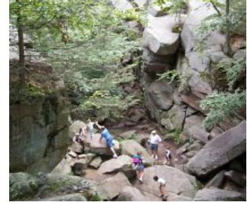
Purgatory Chasm State Park Sutton, MA

Responsible Parties: Land Trusts, MA-DCR, RI-DEM, Municipalities