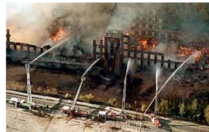
1999 fire at Fisherville Mill