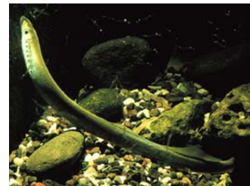
American Brook Lamprey Lampetra appendix