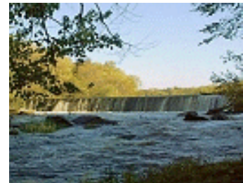
Rolling Dam at Blackstone Gorge, Blackstone, MA

Responsible Parties: MA-DEP, RI-DEM, FERC