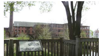
Stanley Woolen Mills