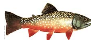
Native Brook Trout ( Salvelinus fontinalis )

Responsible Parties: MA-DFW, MA-DEP, RI-DEM