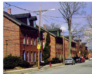
Mill housing in Riverdale (Northbridge, MA)

3. Mill Housing Initiatives: Mill housing (multi-family structures in mill villages) is important to both the history and character of the Blackstone Valley, and has an important ongoing role in providing housing within historic village centers. Steps should be taken to encourage investment in and preservation of maintaining mill housing, including: