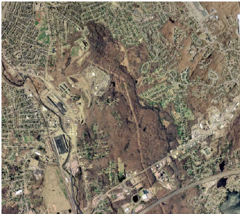
Aerial view of the Massachusetts Audubon Society's Broad Meadow Brook Sanctuary (Worcester, MA)

Responsible Parties: All watershed stakeholder organizations