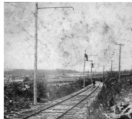
Grafton-Upton Railroad, circa 1920's

Responsible Parties: Land Trusts, MA-DCR, municipalities