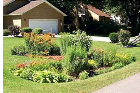
A Low Impact Development (LID) rain garden.

Responsible Parties: MA-EOEA, RI-DEM, municipalities, universities