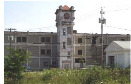
Stillwater Mill