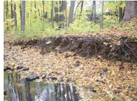
Eroding bank at Coal Mine Brook, near Lake Quinsigamond.

Responsible Parties: MA-EOEA agencies, RI-DEM