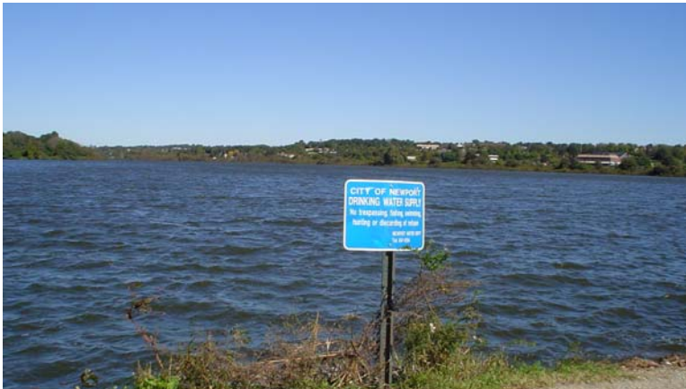
North Easton Pond (Green End Pond) from the causeway.