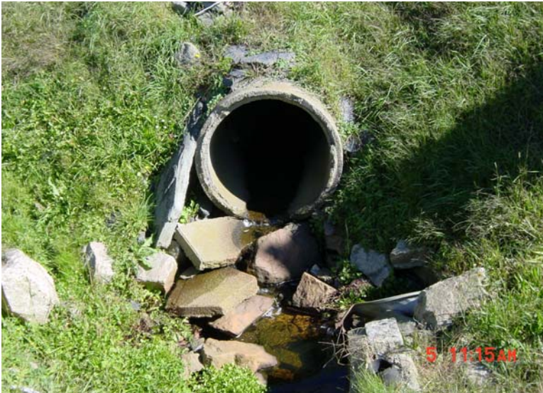
View of culvert pipe just upstream of tributary crossing at Aquidneck Avenue (just north of Prospect Street).

TRIBUTARY #4: Flows southwest towards the southeast corner of North Easton Pond. Stream channel is located just north of the southern extent of Aquidneck Avenue.