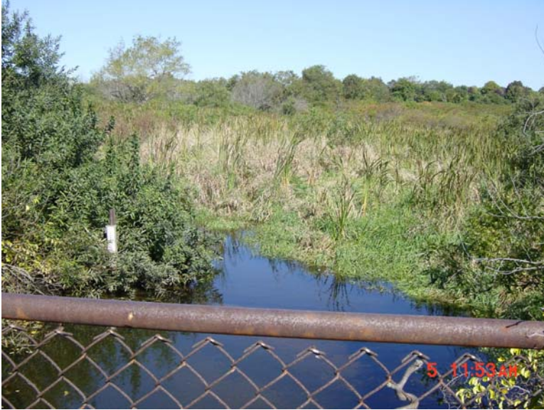
View upstream from Green End Avenue, just north of confluence with North Easton Pond.