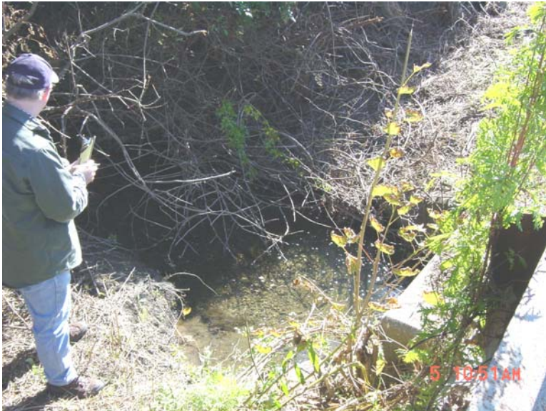
View upstream of tributary crossing at Valley Road.