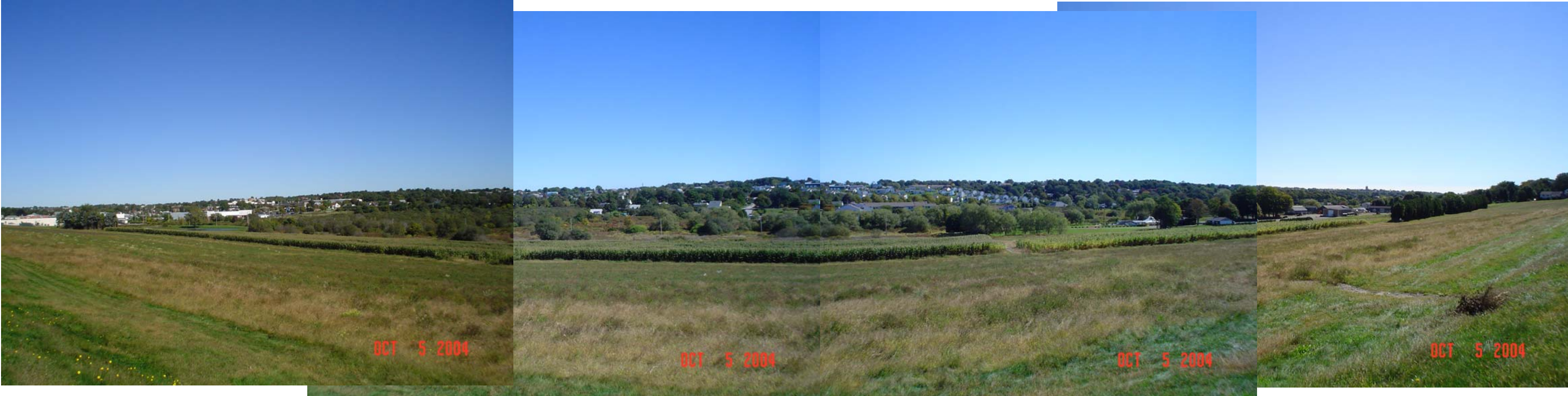
Panoramic view of Bailey Brook Watershed from High Street (view across Boulevard Nursery property).