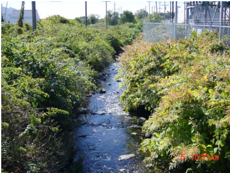
View downstream from stream crossing at East Main Street.