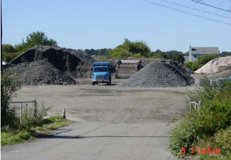
Sand/gravel operation on Aquidneck Avenue. Stream culvert is located under entrance drive shown in photo.

TRIBUTARY #4: Flows southwest towards the southeast corner of North Easton Pond. Stream channel is located just north of the southern extent of Aquidneck Avenue.