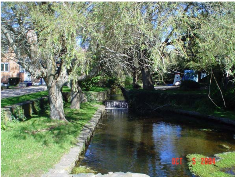
View upstream from Forest Avenue