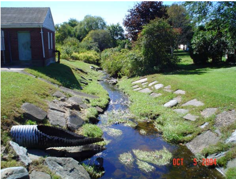
View downstream from Forest Avenue.