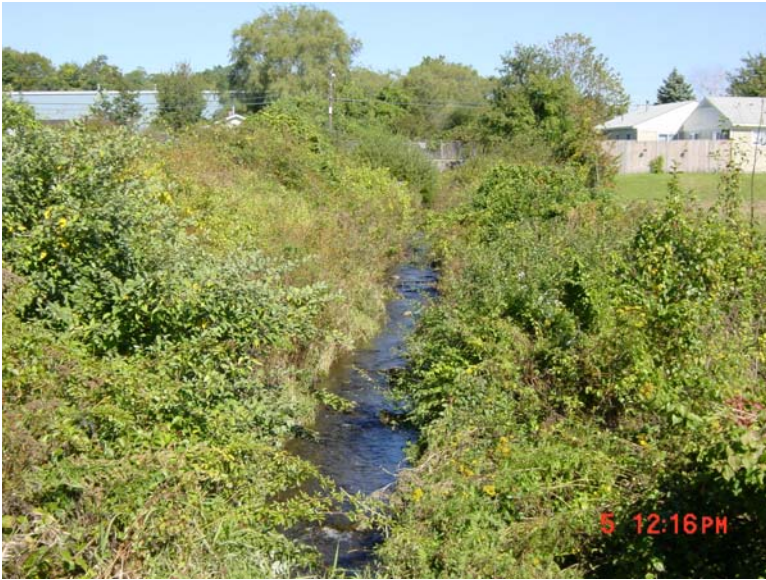
View upstream towards Woolsey Road from Valley Road.