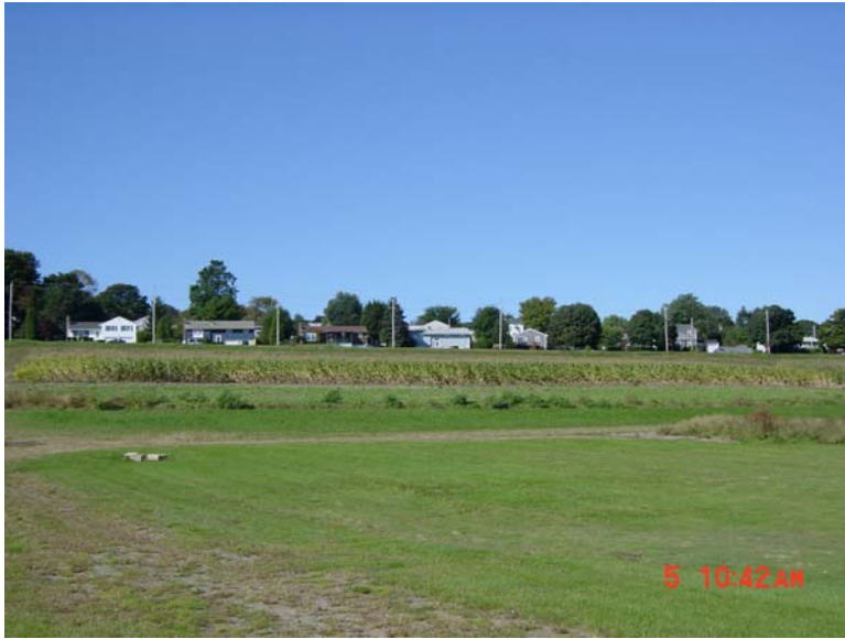
View west towards Boulevard Nursery corn field (adjacent to east of Bailey Brook).