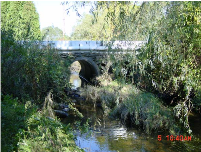
View upstream towards bridge crossing at Clambake (off of Valley Road).