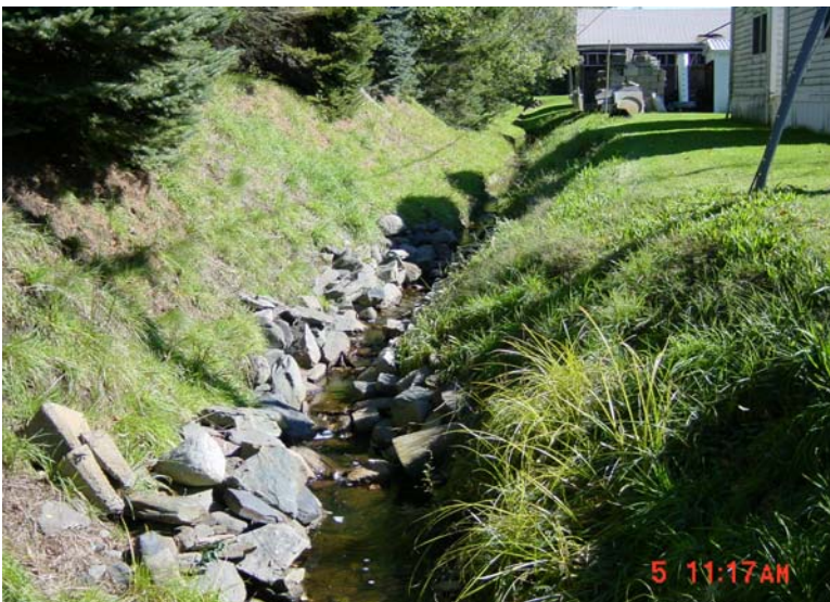
View upstream of tributary along north side of the Paradise Motel property (just upstream of Aquidneck Avenue).