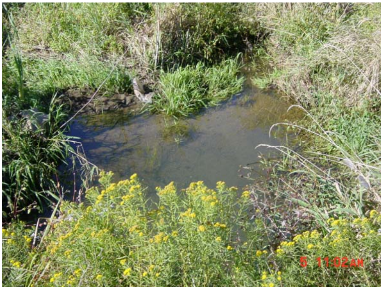
Small ponded area just east of Aquidneck Ave. (just south of Vierra Terrace). Pond drains to culvert pipe at sand/gravel operation that daylights to southwest.