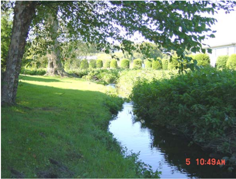
View downstream of tributary crossing at Valley Road (north of Goldenrod Drive). Note poor buffer along the tributary's south bank (mowed turf grass).

TRIBUTARY #3: Flows southwest from Aquidneck Avenue (just south of Vierra Terrace) towards confluence with Bailey Brook just north of Green End Avenue.