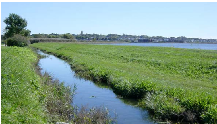
Drainage swale system surrounding South Easton Pond.