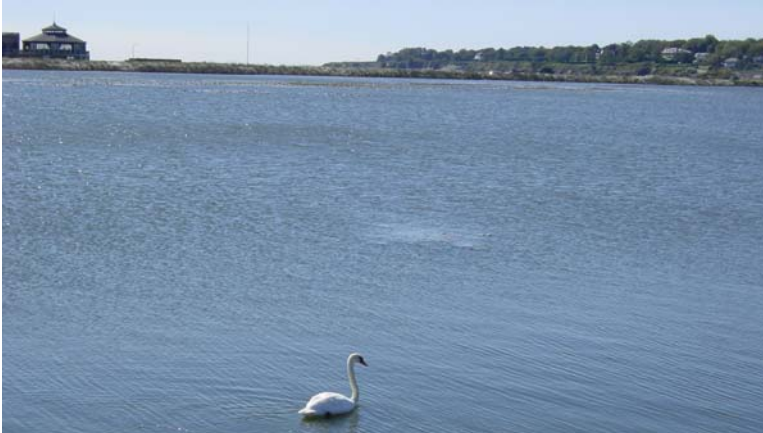
South Easton Pond from the causeway.