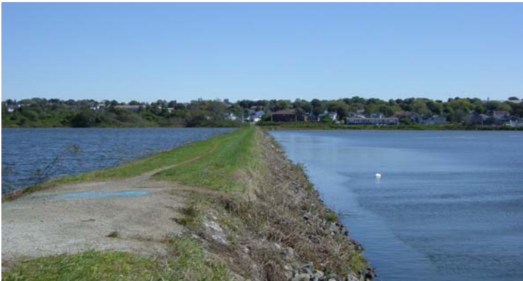
The causeway between North and South Easton Pond.